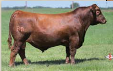
BIEBER JUMPSTART J137