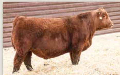
Full Sib to Lot 3B