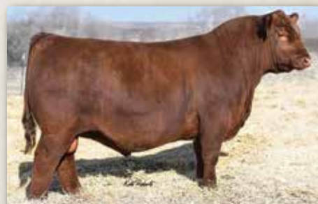
RED U2 TOWNSHIP 17G