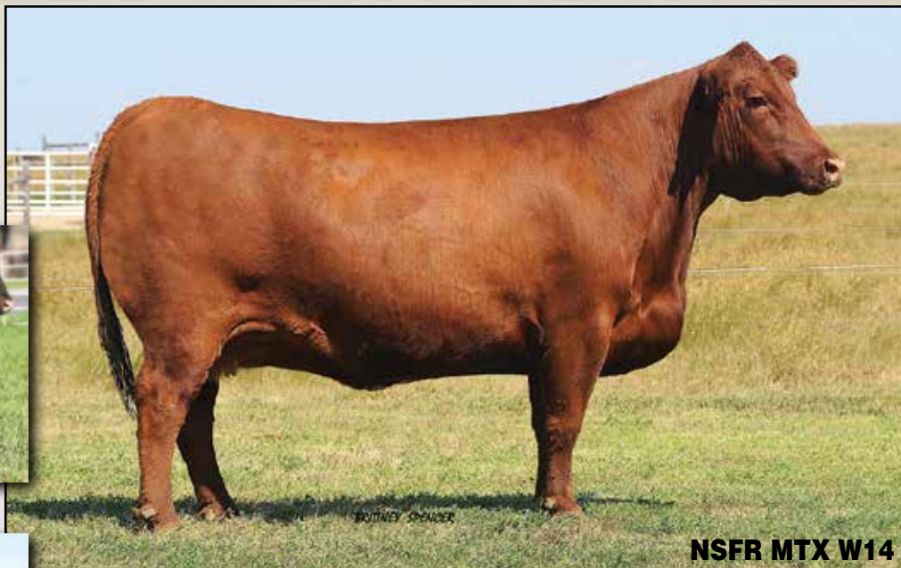
NSFR MTX W14

NSFR MTX W14 is a cow that flat out gets the job done. She was born and raised at Nordlund Stock Farm where she was purchased by Rust Mountain View Ranch. She was a donor at Rust Mountain for many years before we acquired her. The MTX cow family is a true cow-maker family. The daughters we have in our herd are outstanding. She also raises awesome sons with her PIE Cinch son topping the sale in 2020 to Weber Red Angus and Charolais where he is working very well for them. We have used all these matings in our program with great success. They are true female-making embryos.