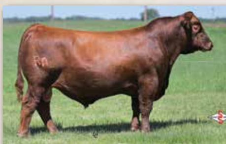
BIEBER JUMPSTART J137