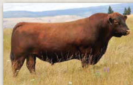
RREDS SENECA 731C

RREDS Seneca 731C needs very little introduction for what he has done for people around the country. We have full sibs to these embryos in production and they are good-looking cows.