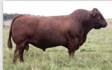
CRUMP FORERUNNER 6601

Crump Forerunner has put some awesome females back into our program. We feel this mating will really click.