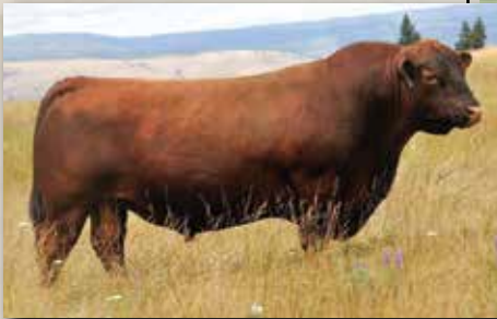
RREDS SENECA 731C