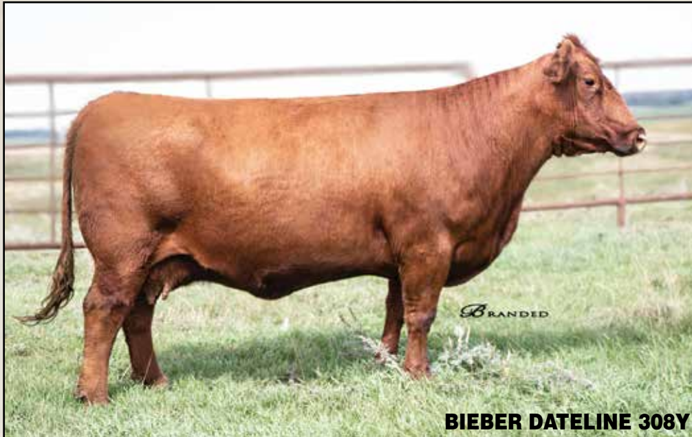
BIEBER DATELINE 308Y

We purchased Bieber Dateline 308Y a few years back off of Bieber's fall production sale. She is most well-known for raising the $65,000 Bieber Atomic who sold to Accelerated Genetics. She is an easy-fleshing, good-footed and good-uddered cow.