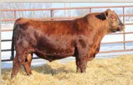
STRA ADMIRAL 0150