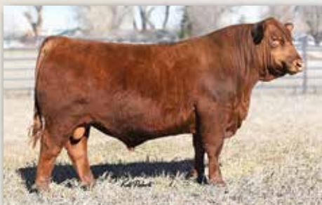
CRUMP SUPREME 7813

Dateline and Crump Supreme produce powerhouse embryos with high growth.