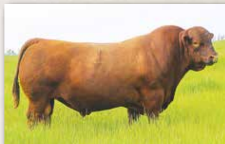
PIE CINCH 4126

The Dateline x Cinch mating has done wonders for our program and the daughters are working great now. Awesome, proven embryos here.