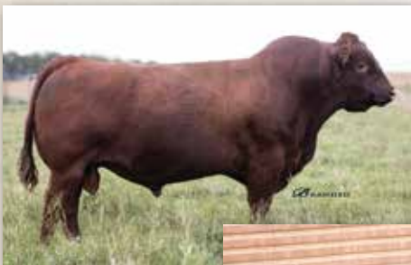
CRUMP FORERUNNER 6601