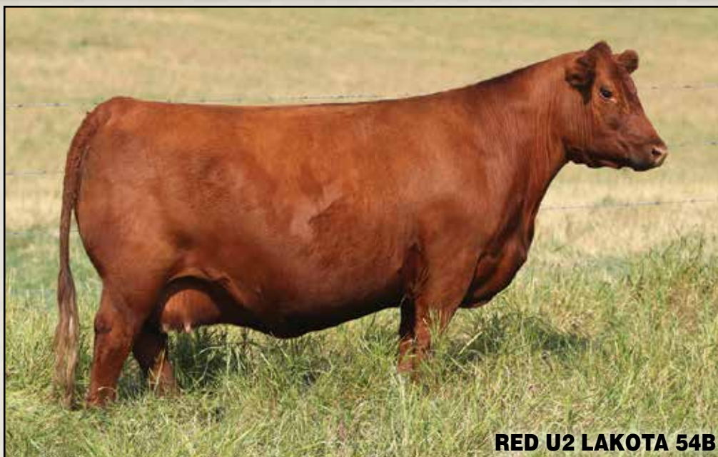
RED U2 LAKOTA 54B

For the first time ever, we are offering embryos off of 54B. She is the second-high-selling cow from the U2 dispersion selling for $55,000. One of the most beautiful cows you will ever see. She is perfect footed and flat out just gets it done. We have calves on the group on this mating and they are incredible. These will probably be the only embryos ever offered on this cow.