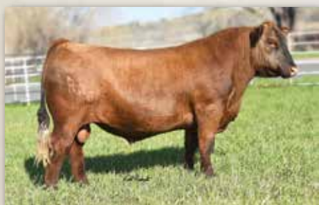
BIEBER DRIVEN C540

Bieber Driven C540 has been a herd sire here for many years. He will be breeding cows again for us this year at 8 years old. He has put some of the most productive daughters back into our herd. Proven, awesome embryos here.