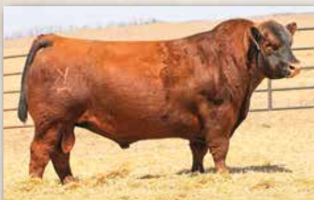
RREDS BLUE PRINT H001

The next set out of 158W are by the $115,000 U2 Township. This mating works very, very well. You should see the replacement heifer in our pen out of this mating! Another proven mating that works very well.