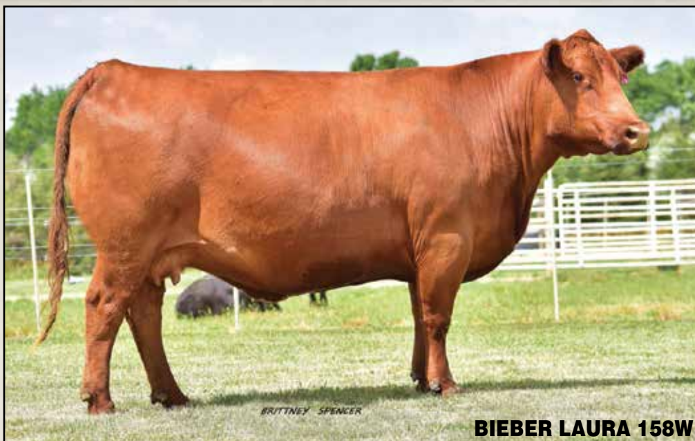
BIEBER LAURA 158W

The Laura 158W cow needs little introduction. She has flat out changed our program. She has put many daughters back into our herd and we have sold many high-selling bulls out of her. She is most well known for being the dam of Bieber Hard Drive. She has an MPPA of 111