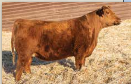
RAINBOW 417C DAUGHTER