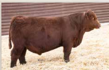
RAINBOW 417C SON