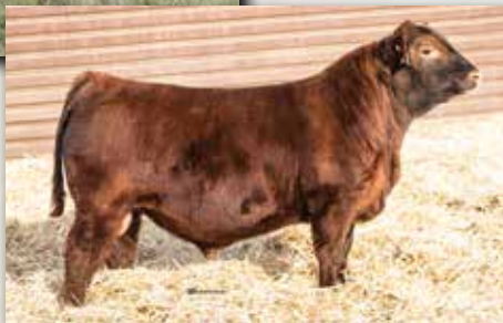
BIBER BELGA 345X SON