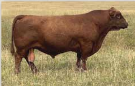
RED MINBURN COPENHAGEN 3Y

Copenhagen 3Y took the breed by storm after the U2 dispersion when the daughters were the high-selling sire group. They just flat out get the job done. The heifers out of this deal will be special.