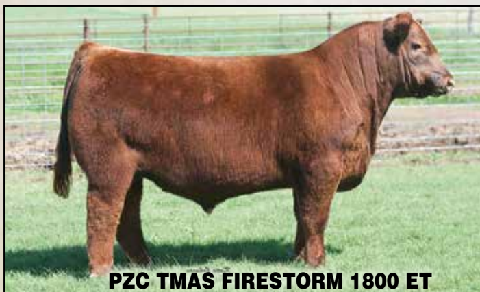
PZC TMA5 FIRESTORM 1800 ET