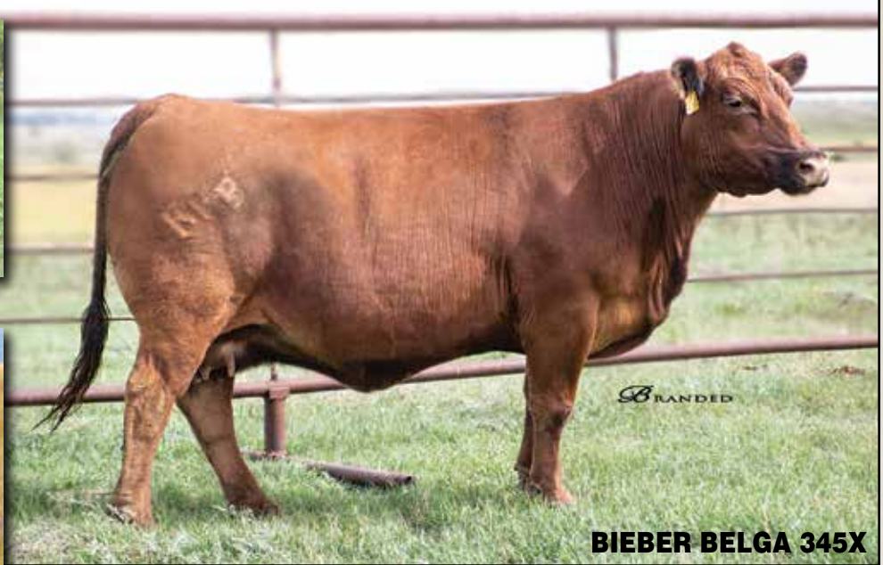
BIBER BELGA 345X

Bieber Belga 345X was a cow we purchased from Biebers. She started her career with us by raising one of our high sellers, STRA Hercules, to Nordlund Stock Farm. Hercules is doing an awesome job for them. She ranks in the top 1% for HB and 7% for PROS. She has a 108 MPPA. Belga is making a difference in our program, and I know she can do it in yours too. We have used all these matings in our program with great success. We are confident in all of them.