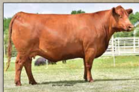
BIEBER LAURA 158W – #1311673

DVAuction Broadcasting Real-Time Auctions www.DVAuction.com