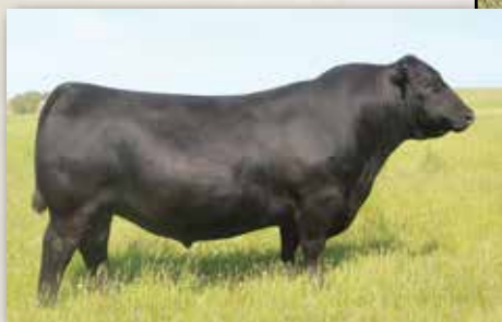
S A V RAINFALL 6846