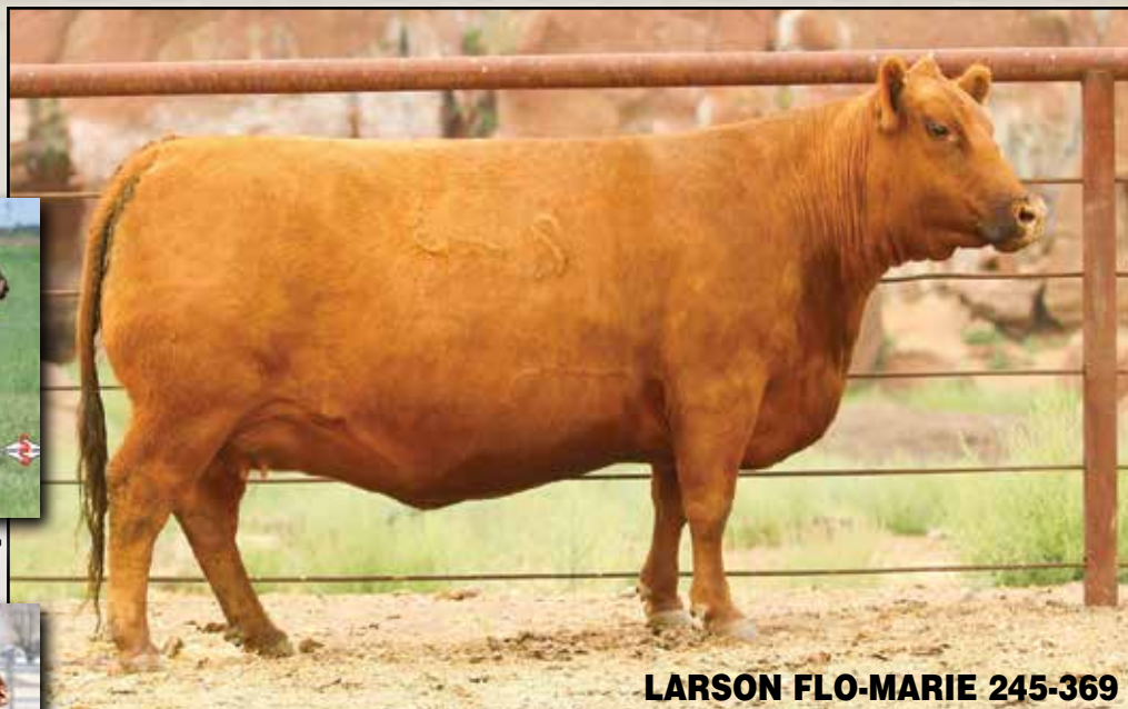
LARSON FLO-MARIE 245-369