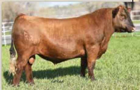
BIEBER DRIVEN C540