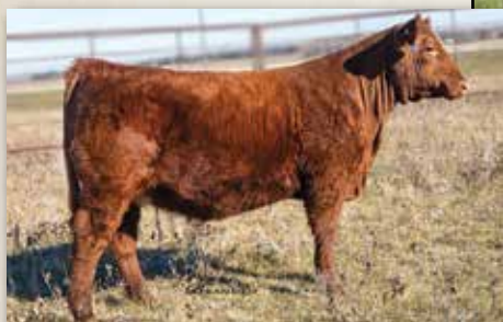
RAINBOW 417C DAUGHTER