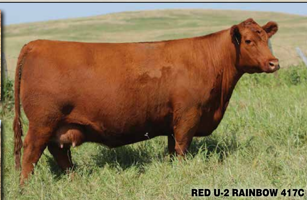
RED U-2 RAINBOW 417C