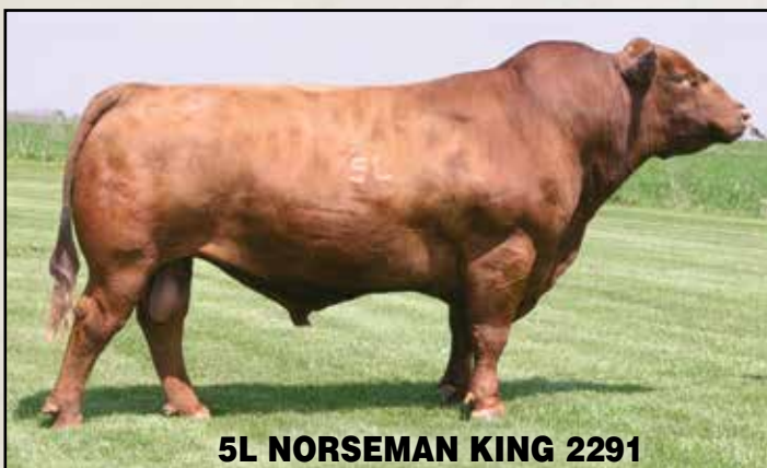
5L NORSEMAN KING 2291