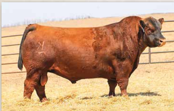
RREDS BLUE PRINT H001