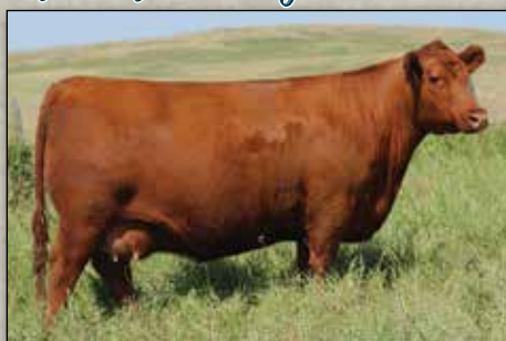
RED U-2 RAINBOW 417C – #2585248