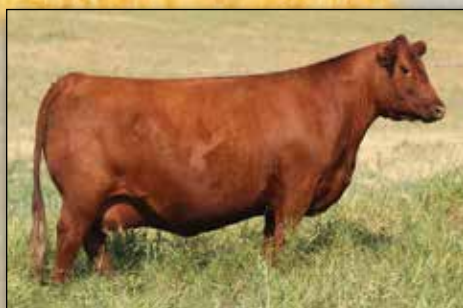
RED U2 LAKOTA 54B – #4362489