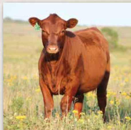
DAUGHTER OF 54B