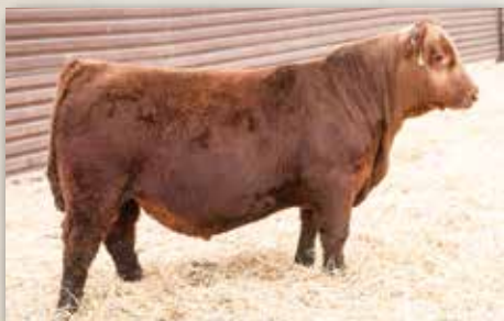
Full Sib to Lot 3A